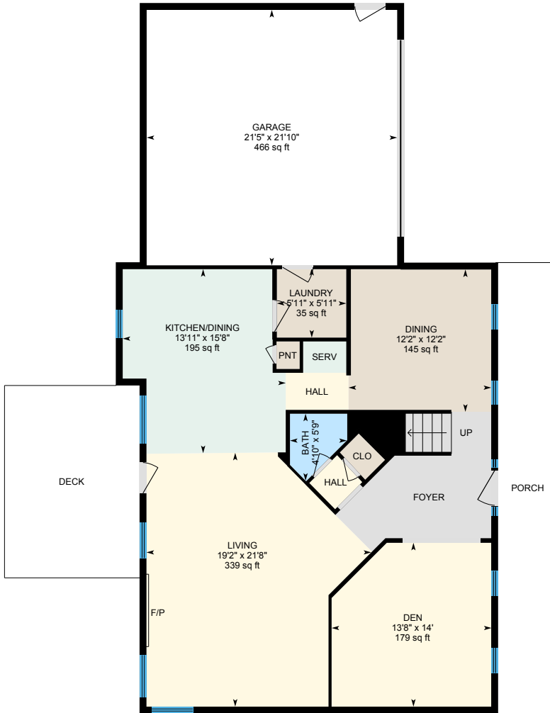
1st Floor Exterior Area 1200.40 sq ft

Main Building: Total Exterior Area Above Grade 2686.00 sq ft